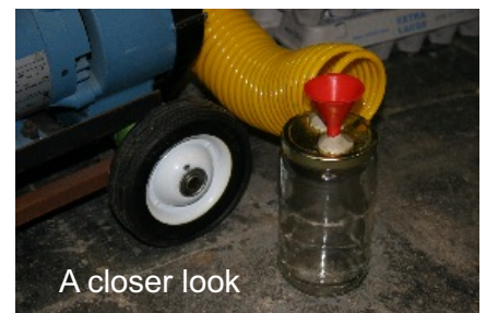
A closer look