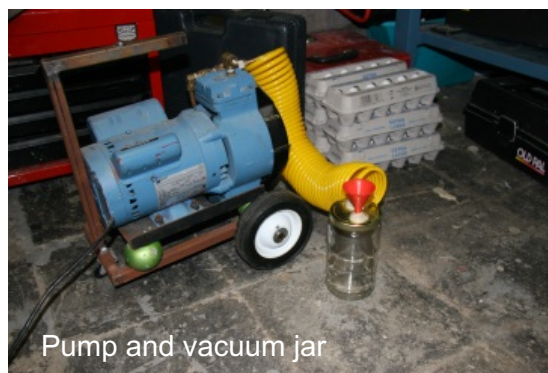
Pump and vacuum jar