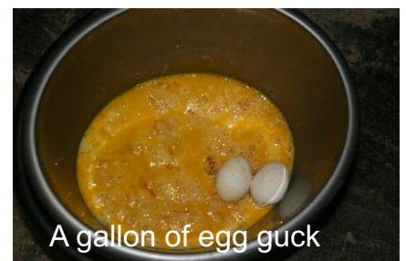
A gallon of egg guck