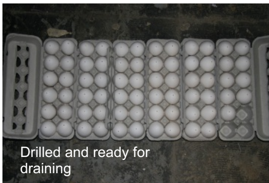
Drilled and ready for draining